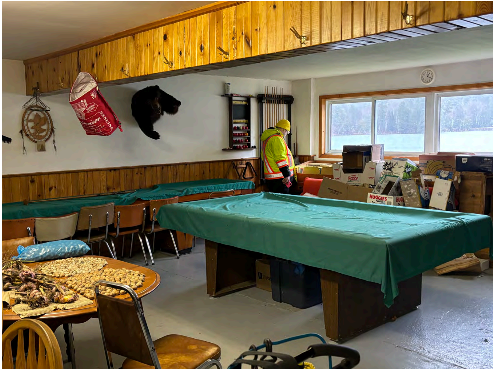
A view of Studio 1 - note the beautiful view of Little Snake Lake AND the hickory nuts drying on the table!